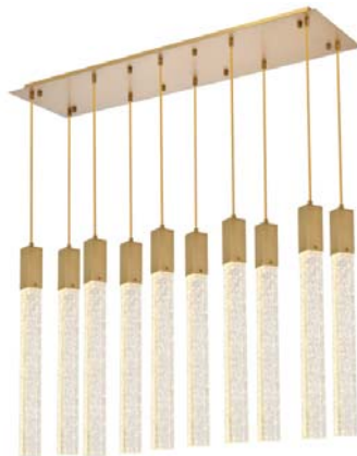
Stain Gold Item No: 2066D42SG