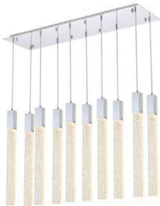
Chrome Item No: 2066D42C